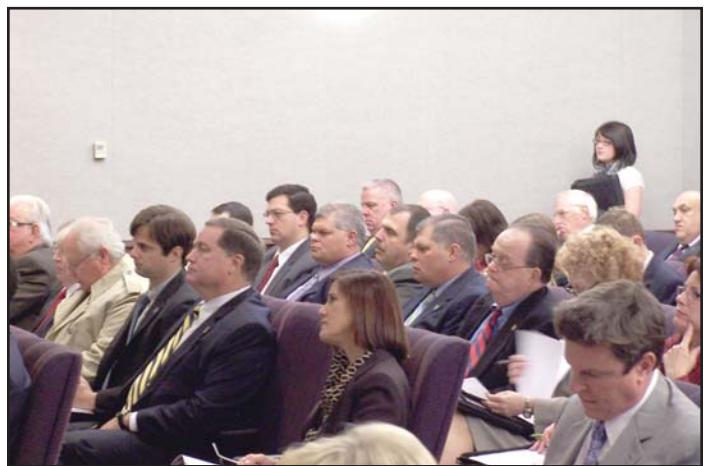
The vast majority of people shown attending just one of the committee meetings are PBA lobbyists, board members and representatives.